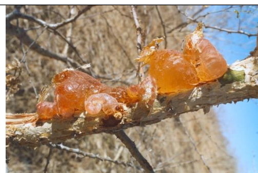
Acacia gum: History of the Future