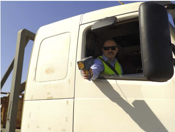
Fig. 1. Measuring the difference between the vicinity and the vehicle body with a field meter.

This method yielded stable signals that increased linearly with speed and immediately dropped to zero when changing from insulating to dissipative tracks. This method was chosen because it allows voltages to be measured during driving without any contact to the outside. Only one limitation was found: Cars with plastic parts near the field meter (e.g. plastic fenders) may produce a noise signal (in our case 1 FU) if the fenders become charged by dusty air during driving. However, this offset signal can be easily detected by driving the vehicle over conductive roads.