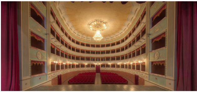
Fig. 1. Petrarca Theatre – interior view.