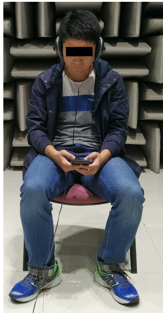
Fig. 1. Subject on the chair.

The noise signals were recorded by the artificial head at the ear positions of the co-driver of 3 types of micro commercial vehicles