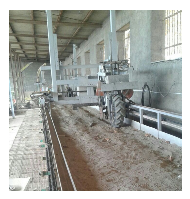
Fig. 1. The general testing of soil bin facility and single-wheel tester for conducting experiments.

The experiments were conducted to investigate the effect of sheep manure, tire passes, soil moisture content, and depth on soil compaction. A summary of the experimental dependent and independent variables is presented in Table 2. Manure with a dry bulk density of 300 kg m<sup>-3</sup> was provided by research farm of the University of the Urmia. Physical and chemical properties of the manure tested in the present work are presented in (Table 3). Manure was incorporate in the soil at rates of 0 (control without amendment), 45, 60 and 90 Mg ha<sup>-1</sup> that are typical rates used