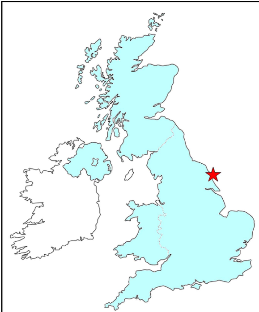
Fig. 1. Flamborough Head, indicated by the star on the map.

change in MPA management which targeted recreation in the area. Results show that investments that add value to the recreational experience in a coastal MPA can generate economic benefits. A discrete choice experiment (CE) is employed to estimate Willingness to Pay (WTP) values for MPA attributes.