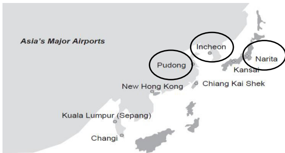
Fig. 1. Geographical locations of IIA, PVG, and NRT

It is anticipated that demand of air transport among countries in North Asia including South Korea, China, and Japan will increase much more than any other region in the world due to rapid economic development in the region (John, 2013), high population density, and stabilized political status (Park 2003). On the other hand, the increasing demand trend in the region has brought fierce competition to accommodate transfer demands and strengthen one’s positions as a regional hub among the three major airports in each of the countries; Incheon International Airport (IIA) in South Korea, Shanghai Pudong International Airport (PVG) in China, and Narita International Airport (NRT) in Japan (Figure 1)