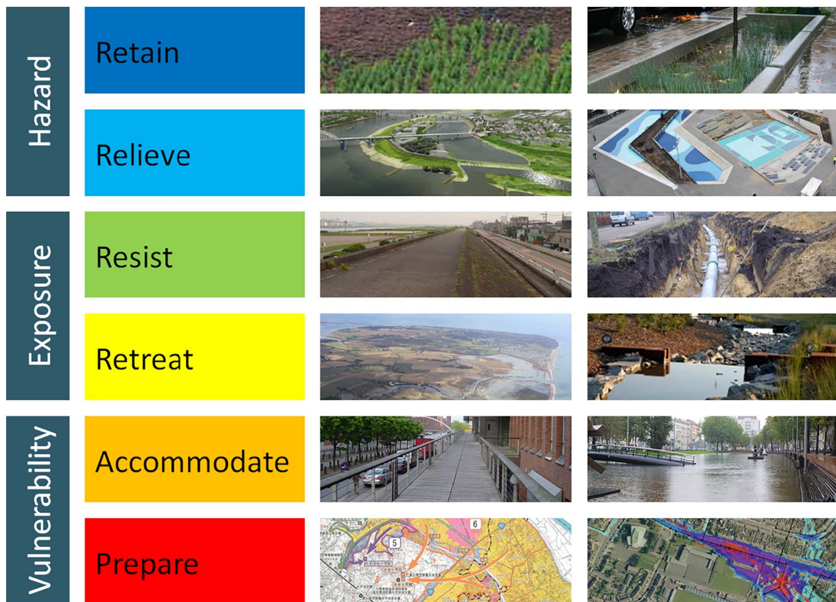
Fig. 1. 4-RAP model of available strategies – where the 4R's signify the retain, relieve, resist and retreat strategies; 'A' signifies accommodate strategy; and 'P' signifies prepare strategy - to enhance flood resilience.