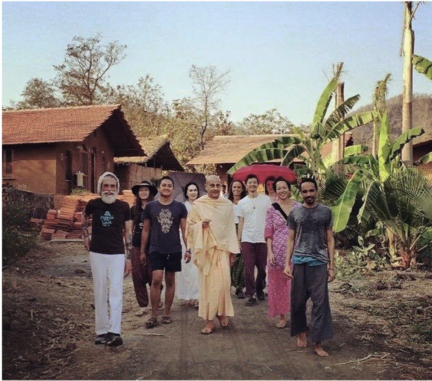
Fig. 1. Yoga practitioners at GEV.

study scaffold underpinned by serious leisure as a conceptual framework (Stebbins, 2001) was constructed. The study and data collection site was the Govardhan Eco Village (GEV) located 108 km north of Mumbai and in close proximity to the Western Ghats that straddles India's west coast. Respondents to this study comprised of foreign nationals in attendance at GEV's yoga retreat and teacher training program. Key emphasis in this paper is examination of the underlying