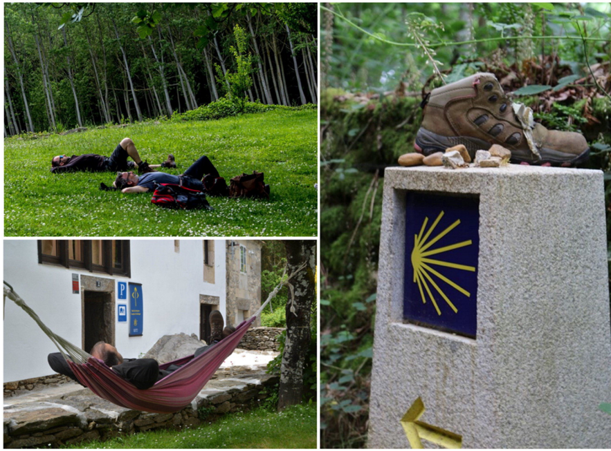
Fig. 1. The Way of St. James, 2016.