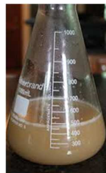
Sterilization (Open nonsterile fermentation for Xylanase production)