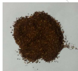
Treated laterite (pH 9)