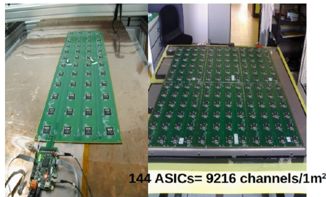
Fig. 2. Development of electronic readout for a large GRPC: size of 1 m 2 .