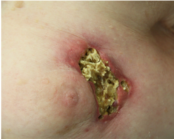
Fig. 1 – Exulcerated tumor in the right breast.

seromas, hematomas, inflammation, and locally high radiation dosage. 1