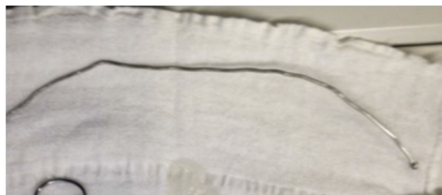
Figure 1 The guide wire used.

Intravenous infusion was made in left arm with Jelco 20G. After intravenous induction with fentanyl (250 mcg), lidocaine (20 mg), propofol (110 mg) and cisatracurium (7 mg), ventilation under face mask was started.