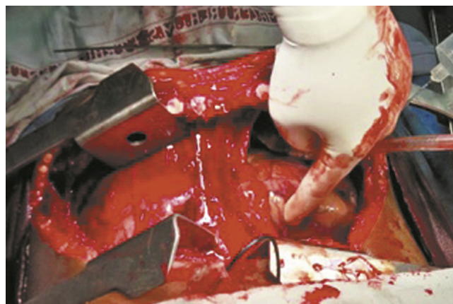
Fig. 2. Digital tamponade.

scan. However pericardiocentesis was performed in 6 cases prior to surgery. Disposition time from emergency department (ED) to the operation theater ranged from 19 to 36 min in cardiac tamponade group. All 7 patients with PCI underwent surgery while 12 cases (86%) of BCI underwent surgery. Overall 19 out of 21 cases underwent surgery and two cases were managed nonoperatively (Table 1). Overall patients 10 had sustained isolated injury to one cardiac chamber. Three cases sustained injury to more than one cardiac chamber and 4 patients had cardiac injury with great vessel injury. Isolated pericardial injury (with no cardiac chamber injury) was seen in 2 cases (Table 2). Out of 21 cases of TCI, 6 had isolated cardiac injury and 15 had associated injuries (Table 3). Overall the mortality following TCI was 28.5%. Mortality was high in patients who presented with hypotension or had perioperative cardiac arrest or arrhythmias and the differences were statistically significant (Table 1). Cardiac tamponade was not significantly related to mortality ( p = 1.000 ), and pericardiocentesis did not show any survival benefit in our series ( p = 1.000 ). The overall mean hospital stay was 25 days (range 15–46 days).