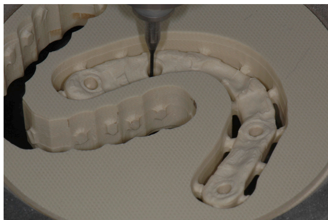
Fig. 3. Fiber-composit disk during milling process. After the digital design, the project is realized through a milling machine.