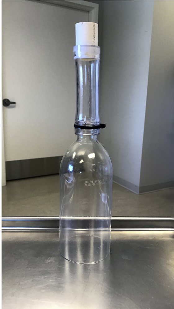
Figure 1. The esophagus and stomach model.