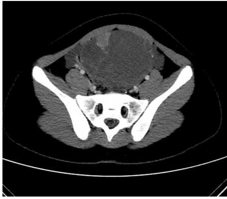
Fig. 1. Computed tomography (CT) scan abdominopelvic region showing heterogeneous hemorrhagic cystic and solid mass.

with Leydig cells with abundant eosinophilic cytoplasm. Both the Sertoli and Leydig cell components were positive for inhibin [Fig. 2A, right]. Leydig cells were positive for AFP, consistent with the increased serum levels (Fig. 3B). There was no associated yolk-sac component with AFP stain. Well-differentiated tubules and Leydig cells formed a minor component. The majority of the tumor was spindled and also stained for Inhibin. This component showed a high mitotic index of up to 32 per 10 high power fields and is consistent with poorly