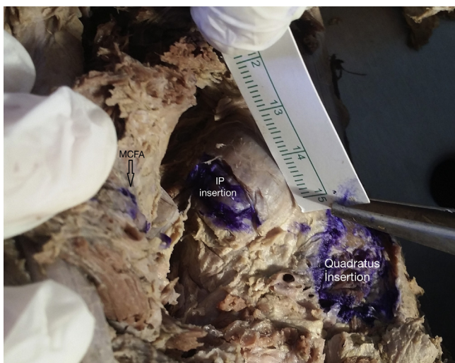
Fig. 1. The iliopsoas and quadratus muscles are elevated and the insertions are marked. (Arrow: medial circumflex femoral artery at the undersurface of the quadratus muscle).

The results are presented in Tables 1 and 2. The lesser trochanter tip was consistently located posterior-inferior to the inferior attachment site of the quadratus. There were no side-to-side differences in the variables tested, except for the distance of the trochanter to the quadratus tendon ( p = 0.04 ) ( 27 \pm 4 mm vs 30 \pm 5 mm). Each incremental 5 mm in depth of bone removal resulted in a significant decrease of tendon area ( p = 0.001 ) at each stage.