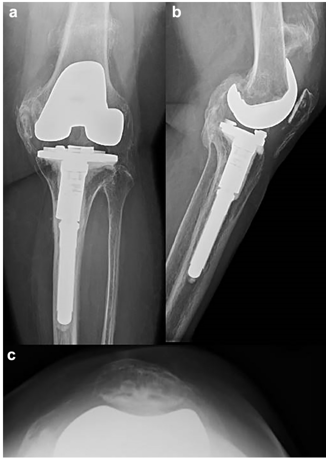
Figure 1. Preoperative radiographs (anteroposterior (AP) (a), lateral (b), and Merchant (c) views) showing extensive heterotopic ossification of the left total knee arthroplasty.