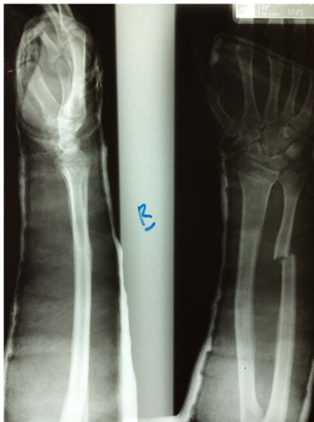
Fig. 1. Plain radiograph revealed an isolated displaced fracture at the junction of distal and middle third shaft of left ulna.

The operation went smoothly without any difficulty in reducing or fixing the fracture and the most important thing was patient did not complain of any pain during the operation (Fig. 3). Patient was discharged home on the same day.