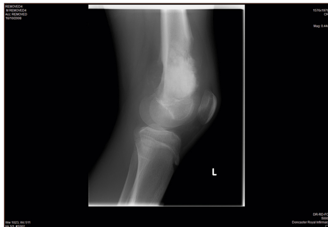
Figure 1 Plain X-ray AP and Lateral of teenager with osteosarcoma of distal femur.

Whole body technetium-99m bone scan and chest CT are performed to assess metastatic disease at presentation. These are