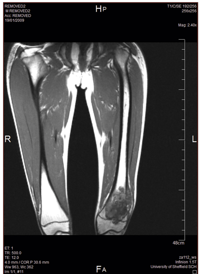
Figure 2 MRI of same patient in figure one.