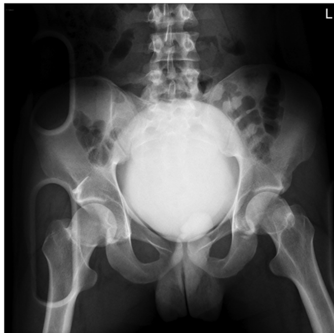
Fig. 3. Post-reduction x-ray.

Posterior hip dislocations are sustained in dashboard injuries as the force toward the knee is directed posteriorly while the hip is in flexion position. Anterior hip dislocations, representing approximately 11% of all hip dislocations, usually result when the hip is forced into abduction