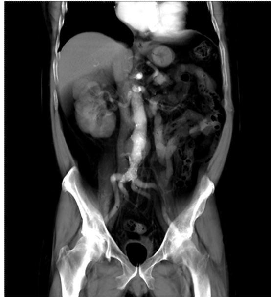
Fig 1. Three-dimensional computed tomography angiogram and illustration showing the preoperative anatomy and measurements.

exchanged for a 0.035-inch Rosen wire, and the 8F sheath was advanced into the right IIA. An 8- × 79-mm Viabahn VBX balloon-expandable endoprosthesis (W. L. Gore & Associates) was passed through the 8F sheath down into the right IIA and extending up into the contralateral limb but not deployed. Next, a 14- × 120-mm iliac extension limb was passed over the Lunderquist wire in the right groin and intussuscepted into the contralateral limb alongside the Viabahn VBX balloon-expandable endoprosthesis but not deployed. The proximal edge of the VBX stent graft was positioned so that it would deploy higher than the iliac extension limb by ~1 cm. The Viabahn VBX endoprosthesis was dilated (Fig 2, B). The 8-mm VBX balloon was exchanged for a 6- × 80-mm angioplasty balloon catheter, which was passed into the VBX graft in the right IIA but not inflated. The 14- × 120-mm right iliac extension limb stent graft was next deployed (Fig 2, C). Next, using a Coda balloon, the right external iliac limb stent graft was angioplastied to profile. At the same time, the 6-mm angioplasty balloon in the right IIA was inflated as well (Fig 2, D).