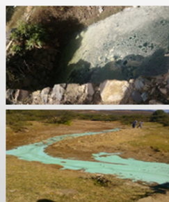
Samples from the mining community