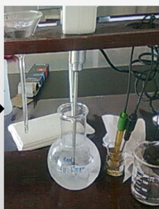
Spherical agglomeration technique