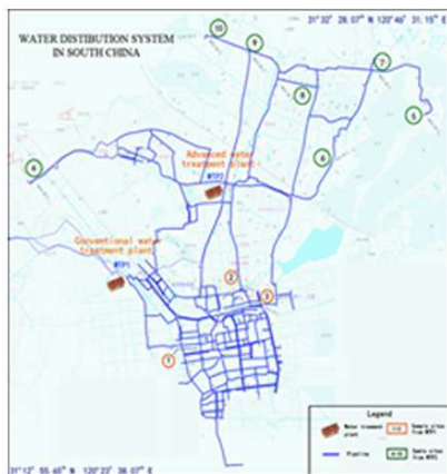
Drinking water distribution system