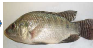
Tilapia ( Oreochromis niloticus )

Sulfamethazine administrated dose (422 mg/kg bw/day for 11 days) via feed.