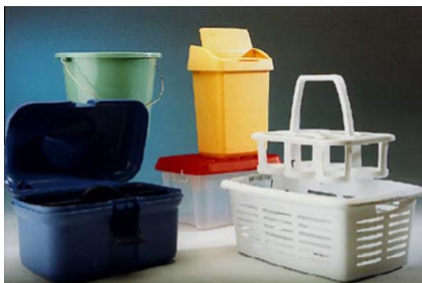
Figure 1 House ware sector application: PP.