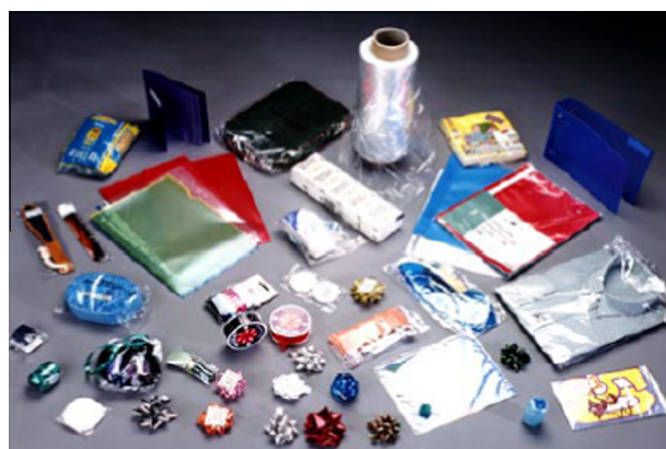
Figure 3 Cast film application: PP.