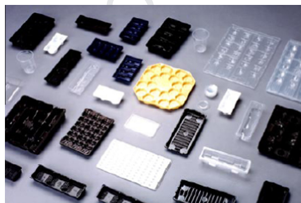
Figure 4 Material development application: PP.