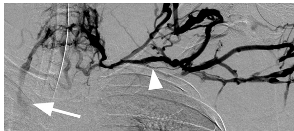
Fig 2. Frontal digital subtraction venography of the left arm showing complete occlusion of the left axillary and brachiocephalic veins (arrowhead). Numerous collateral veins are seen in the upper chest that reconstitute the superior vena cava (arrow).

Multiple attempts were made to access the thoracic duct through a transvenous retrograde approach but were ultimately unsuccessful. A transcervical retrograde thoracic duct cannulation was performed. While pressurized contrast material was simultaneously being injected from the left arm sheath to opacify the thoracic duct through retrograde reflux of contrast material, a horizontal lymphatic channel leading to the thoracic duct was accessed in a percutaneous transcervical fashion using a 21-gauge \times 10-cm Chiba needle under fluoroscopic guidance (Fig 4). Once access was obtained, an 0.018-inch Nitrex wire (Covidien) and a 2.4F Progreat microcatheter (Terumo Interventional Systems) were advanced into the thoracic duct (Fig 5). Lymphangiography demonstrated a leak at the level of the diaphragm (Fig 5). Embolization of the thoracic duct above and below the leak was performed with 2:1 ethiodized oil (Guerbet) and n -butyl cyanoacrylate