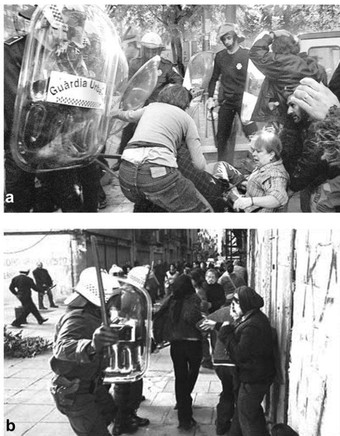
Fig. 3. Police charge upon neighbours (a) and activists (b) in the Hole of Shame. In November 18, 2002, all occupants were removed from the space in order to start its official development.

The interviews were conducted with representatives of all the parties involved in the conflict. They included representatives of members of five organisations defending the occupation, four neighbourhood associations of the PICA (against the occupation), the mediator in the participatory process for the development of the space, the public relations spokesman of Focivesa (urban development company involved in the Hole of Shame case), three district councillors responsible for the area, and two urban planners. Interviews lasted between 30 and 120 min and consisted of a series of open-ended questions. Each interview started with a general question about the Hole of Shame's current state (e.g. 'How do you explain the existence of a space like 'Hole of Shame' in this neighbourhood?' 'What kind of space is it?'),