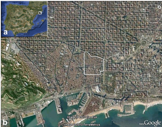
Fig. 1. (a) Barcelona in Spain (white square); (b) Santa Caterina neighbourhood within Ciutat Vella's district (area delimited by white lines).

to discuss a core topic: conflicting experiences of space . Among other themes, the conference was designed to explore tensions between lay and professional definitions of space use; disputes between different social groups about the proper uses of spaces; disparities between planned and actual spatial usages; and conflicting interpretations of the meaning of public and private spaces. The meeting's goals were practical and ethical as well as academic; that is, in generating knowledge about the nature and causes of spatial conflict, contributors sought to devise concrete strategies for fostering peaceful coexistence in everyday spaces. At the same time, contributors also presupposed that "conflicts and tensions between groups are just part of life" (Woitrin, 1979, p.20), and thus constitute a fundamental concern for researchers interested in the relationship between people and their environments.