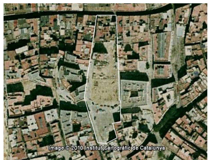
Fig. 2. Empty space in the centre of Santa Caterina in 2004 (area delimited by white lines). Groups of neighbours and social activists progressively occupied the place and built there the Hole of Shame Park.

Around the end of 1999, the local administration demolished a number of decaying and informal dwellings in the centre of Santa Caterina, creating a 6500 m 2 'empty space' crossed by Figuera's Well Street (see Fig. 2). Surrounded by the façades of old residential buildings, this space became a territory under dispute during subsequent years. It was initially cleared, paved and occupied by a group of neighbours, who refused to accept the official urban development plan. On December 15th, 2000, these neighbours planted a Christmas tree in the space, proclaiming it as the 'green zone' that was originally planned in the PERI. The space was labelled 'Hole of Shame' in order to signify the administration's history of neglect both of the local environment and of its residents. Within weeks, the tree had become a meeting place for theatrical performances and music concerts. Several empty buildings around the Hole of Shame were occupied by 'squatters' involved in